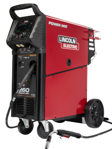
POWER MIG® 260 K3520-1 $675 MFG REBATE