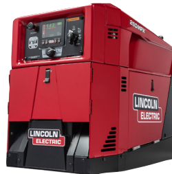
Ranger® 260MPX K3458-1 $950 MFG REBATE