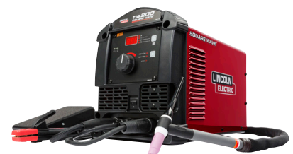
Square Wave® TIG 200 K5126-1 $800 MFG REBATE