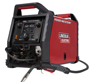
POWER MIG® 215 MPI* K4876-1 $540 MFG REBATE