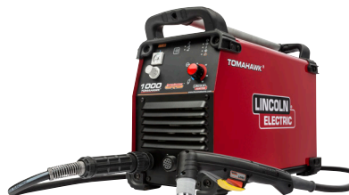
Tomahawk® 1000 K2808-1 $675 MFG REBATE