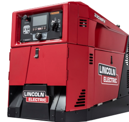
Ranger® 330MPX K3459-1 $1,350 MFG REBATE