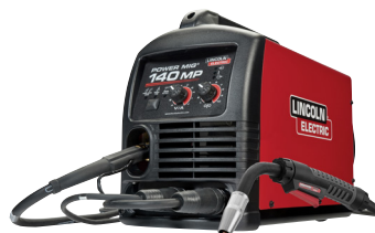
POWER MIG® 140 MP** K4498-1 $135 MFG REBATE