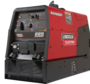
Ranger® 225 K2857-1 $950 MFG REBATE