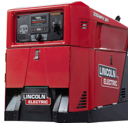
Ranger® 330MPX™ EFI K4779-1 $1,350 MFG REBATE

SPEND $675 In Qualifying Products** Get a $270 REBATE